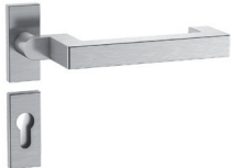
Lever handle design 104X