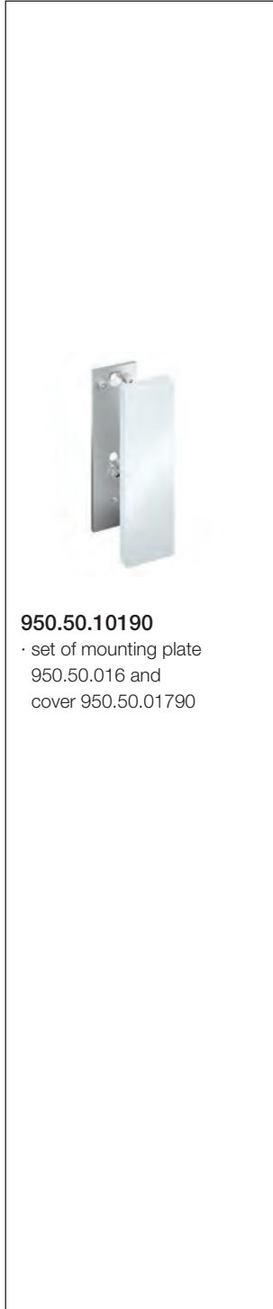
950.50.10190 · set of mounting plate 950.50.016 and cover 950.50.01790